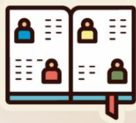
Photo Directories are Ready for Pickup!